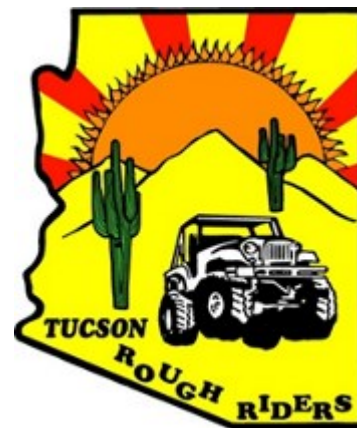
Tucson Rough Riders. Event sponsor.